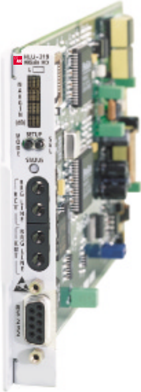
HLU-319 LIST 5D LINE UNIT